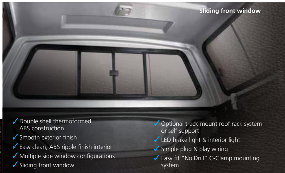
Sliding front window