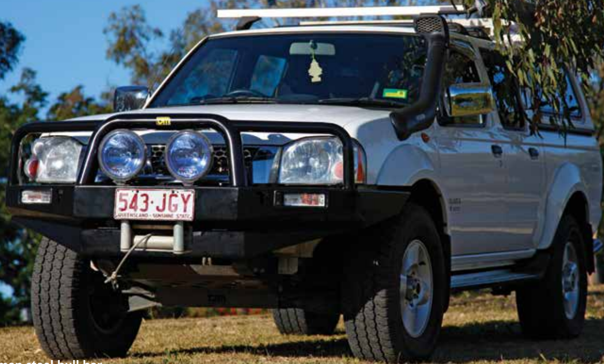
Tradesman steel bull bar 070SB15N090 SUITS PETROL & DIESEL MODELS 01+