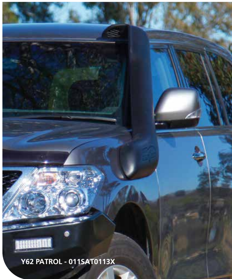
Y62 PATROL - 011SAT0113X

* It is important that the complete Airtec unit is positively sealed to ensure no water ingress at any point.