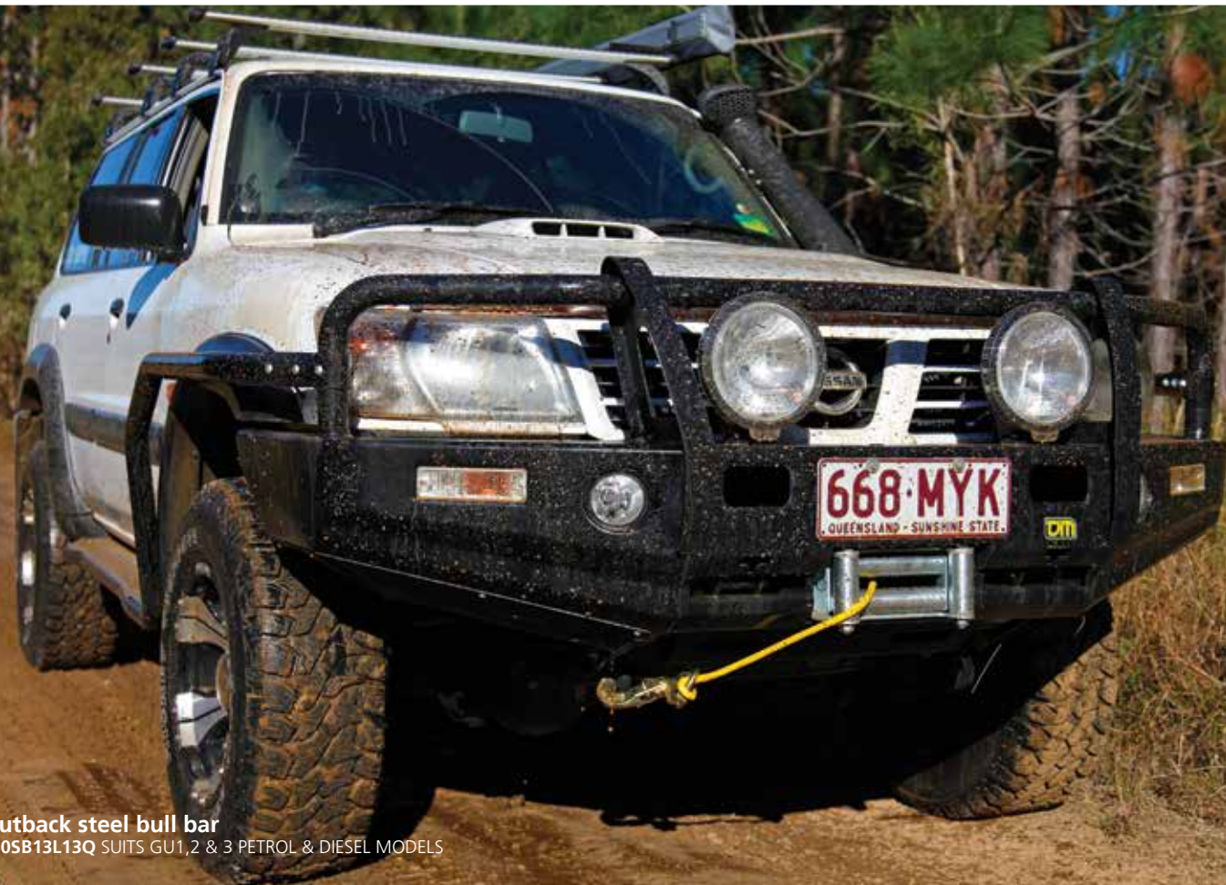
Outback steel bull bar 0705B13L13Q SUITS GU1, 2 & 3 PETROL & DIESEL MODELS