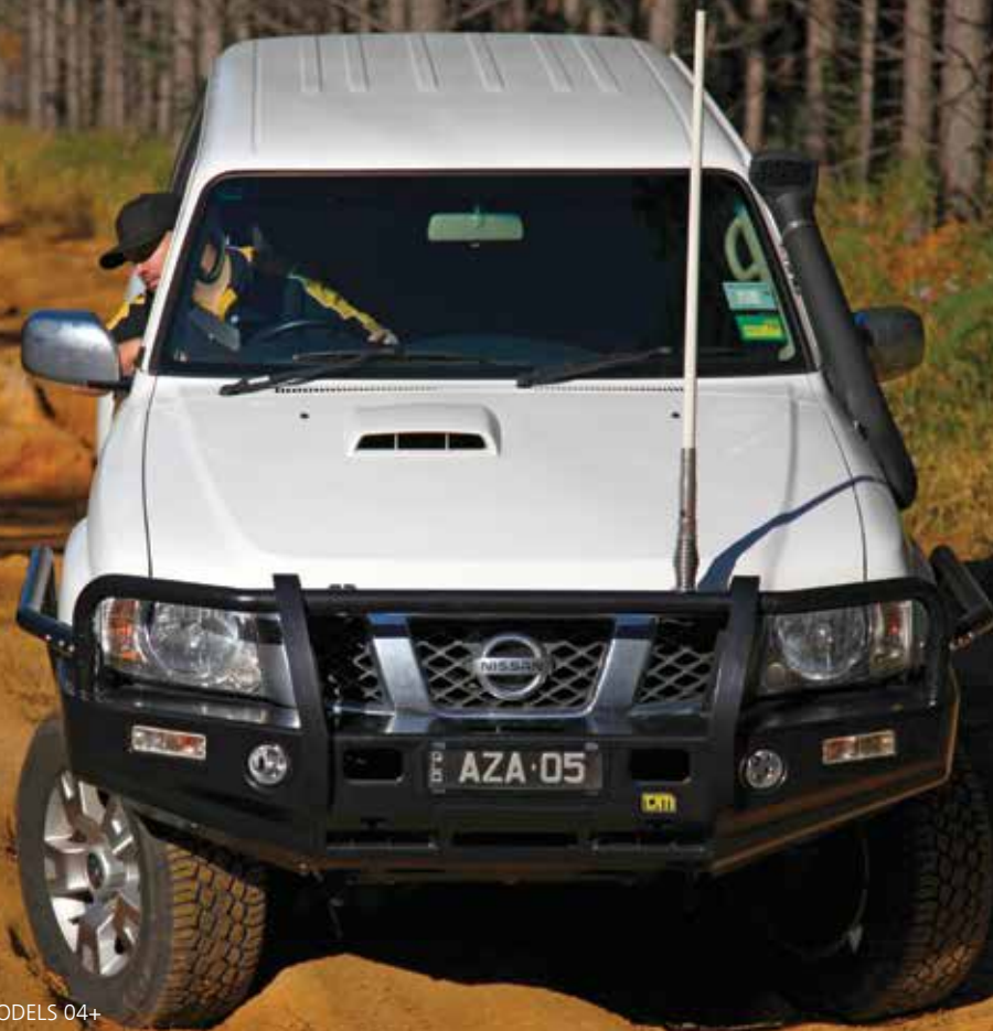
Outback steel bull bar 070SB13L13W SUITS PETROL & DIESEL MODELS 04+