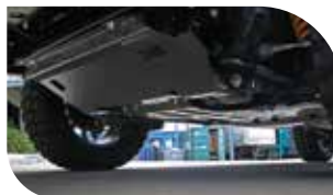
NP300 NAVARA - Underbody Guards