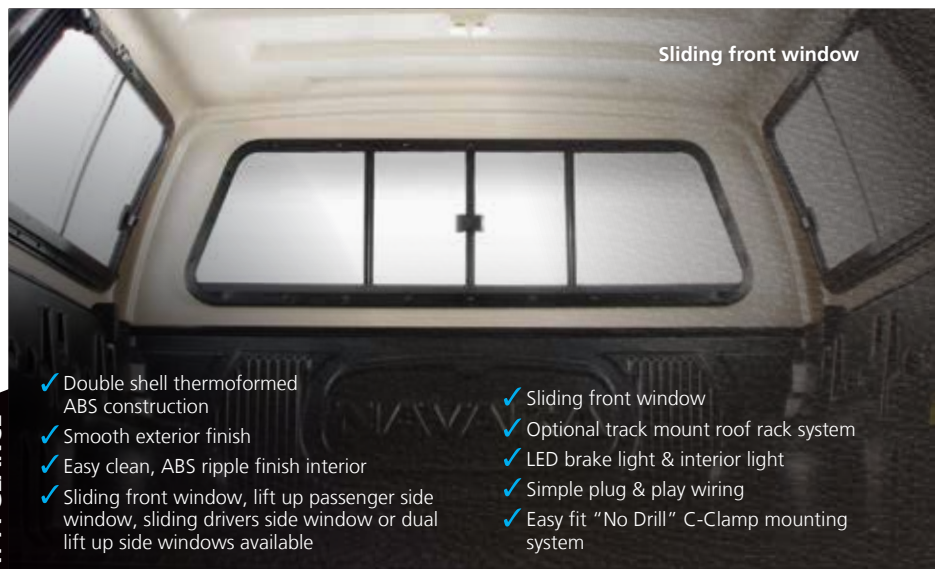
Sliding front window