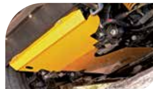
D40 NAVARA & R51 PATHFINDER Front underbody guard & sump guard*