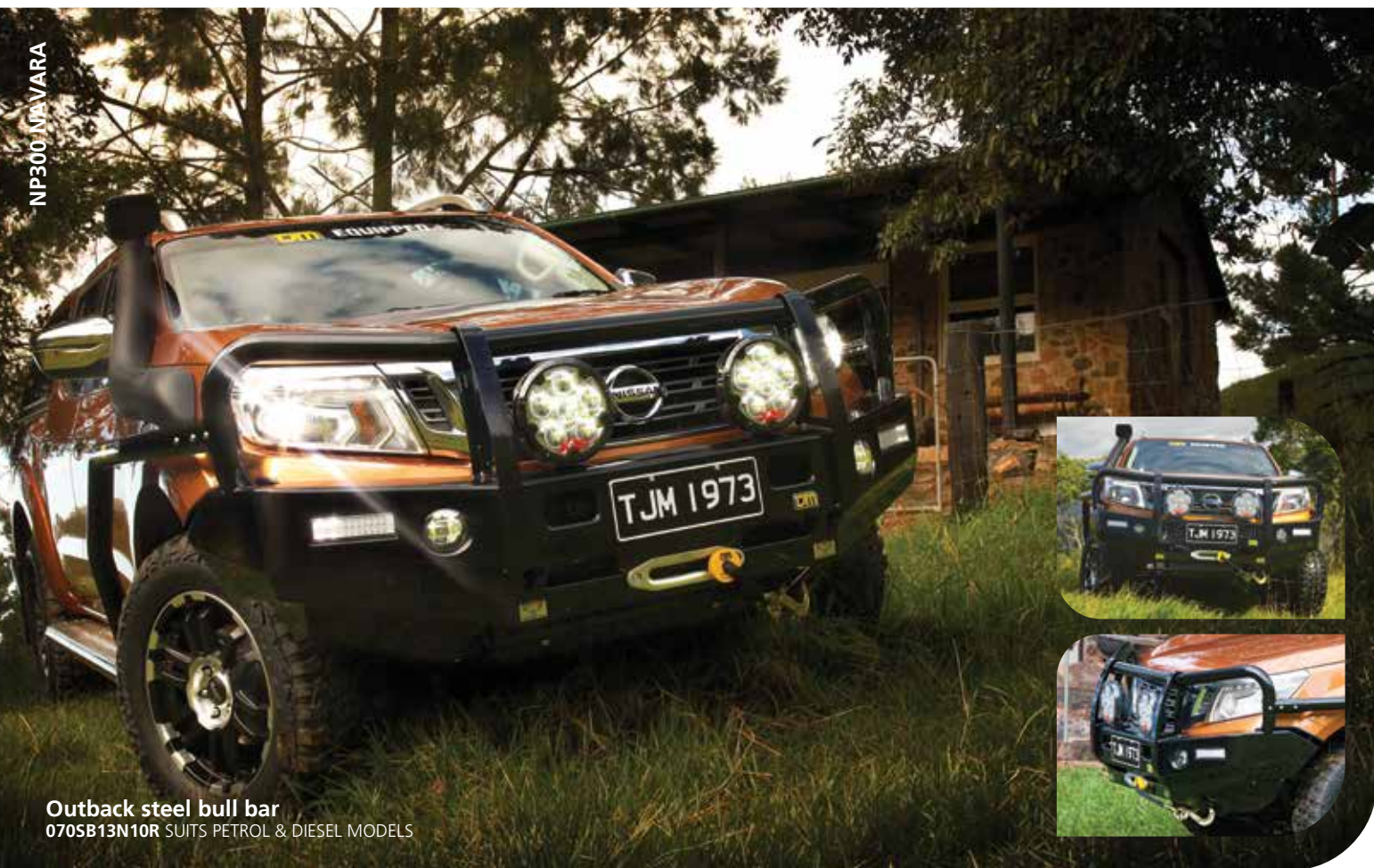
Outback steel bull bar 070SB13N10R SUITS PETROL & DIESEL MODELS