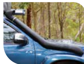
PN. 011SAT0132M (D-MAX 08-12) PN. 011SAT0134E (D-MAX 2012+ & MU-X 2013+)