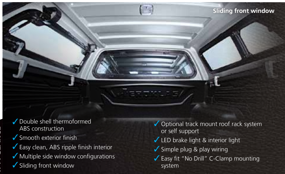
Sliding front window