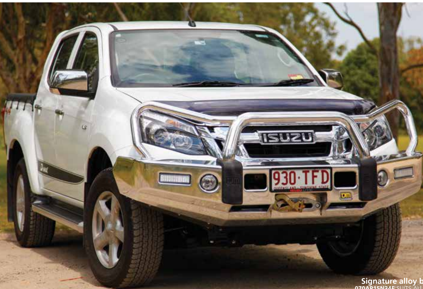
Signature alloy bull bar 070AP15N34E SUITS ALL MODELS