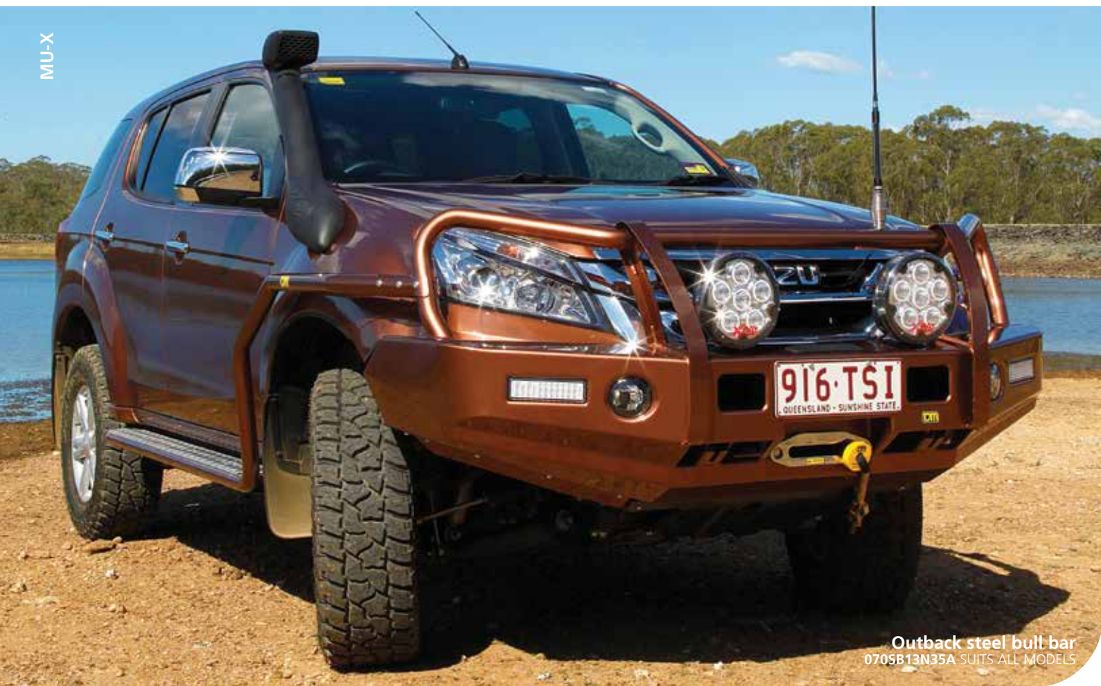
Outback steel bull bar 070SB13N35A SUITS ALL MODELS