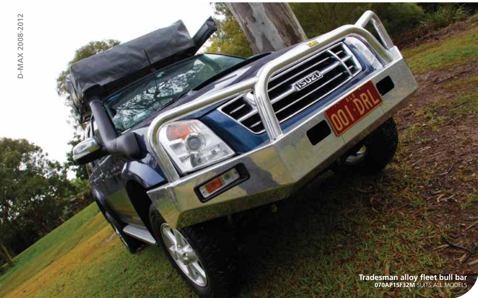
Tradesman alloy fleet bull bar 070AP15F32M SUITS ALL MODELS